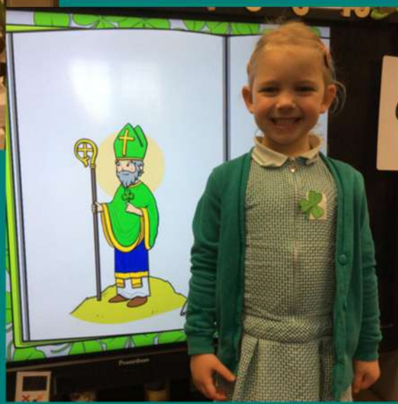
Celebrating St. Patrick's day